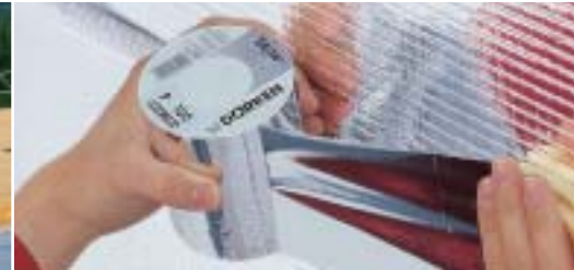
DELTA®-REFLEX PLUS with integrated self-adhesive edge. Typical application on lightweight industrial roof.