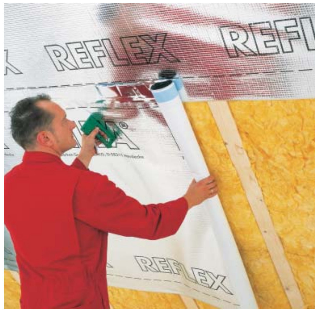
DELTA®-REFLEX – the universal vapour barrier sheet.